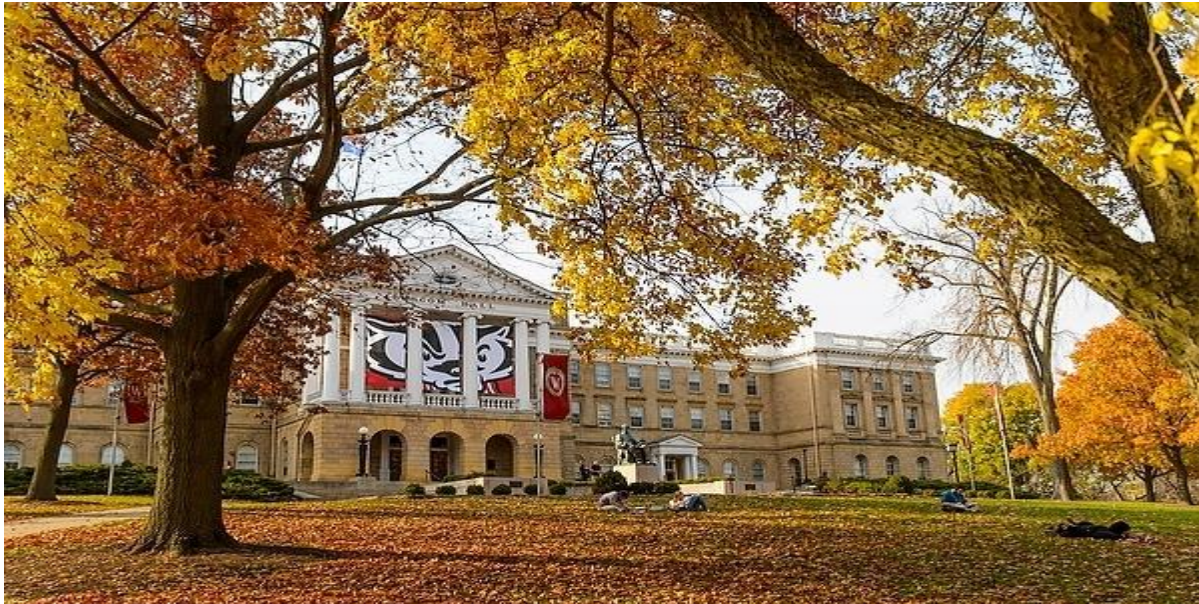
University of Wisconsin - Madison

It is never too early to start preparing students for life after high school and get them thinking about what kind of education, training or career they want to pursue after graduation. For this year's first (and probably most comprehensive) topic, let's take a look at a general timeline for all high school students who are interested in applying to college.