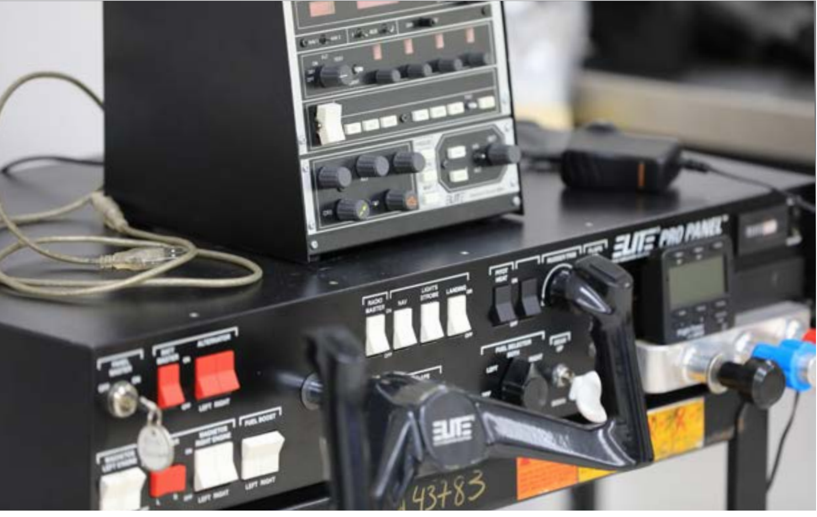
Students can take to the skies and hone their piloting skills in cutting-edge flight simulators. From mastering takeoffs and landings to navigating complex flight paths, students have access to realistic and immersive training experiences which allow them to log actual flight hours!

The proposed ERA Lab was the recipient of the 2023 Fund-a-Need campaign at the annual fundraiser, the Excalibur, and it was generously supported by so many people throughout the entire SJNA community. This began the process to retrofit the learning spaces with the updated technology infrastructure, the student learning and working space and the equipment to get the project started. Much of the work was done over the summer of 2023 so that it opened with excitement to our engineering and aviation students at the start of the 2023-24 academic year.